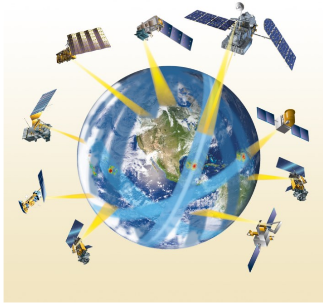
Illustration of the GPM satellite constellation.